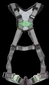
V-FIT™ SAFETY HARNESS