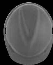
V-GARD® MATTE HARD HAT