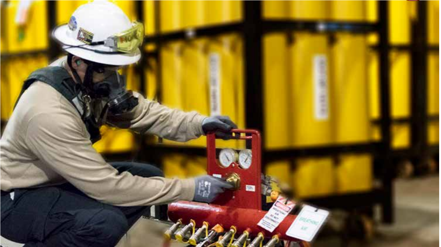
Worker with 12 cylinder pack