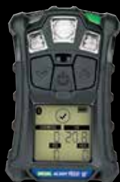
ALTAIR® 4XR MULTIGAS DETECTOR