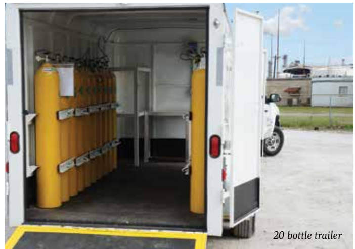
20 bottle trailer