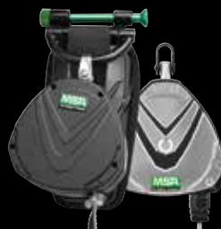
V-EDGE™ PERSONAL FALL LIMITER (PFL)