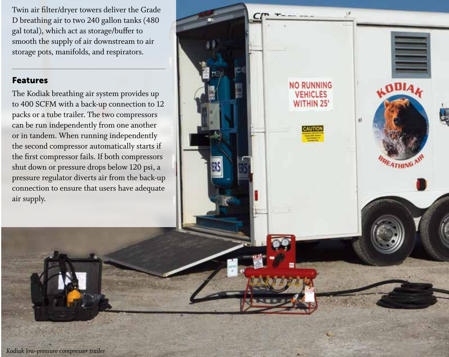
Kodiak low-pressure compressor trailer